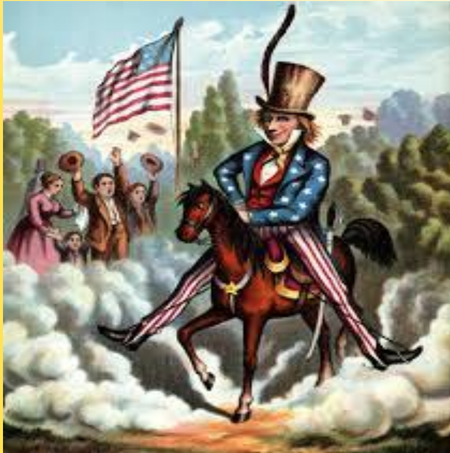
Yankee Doodle Dandy