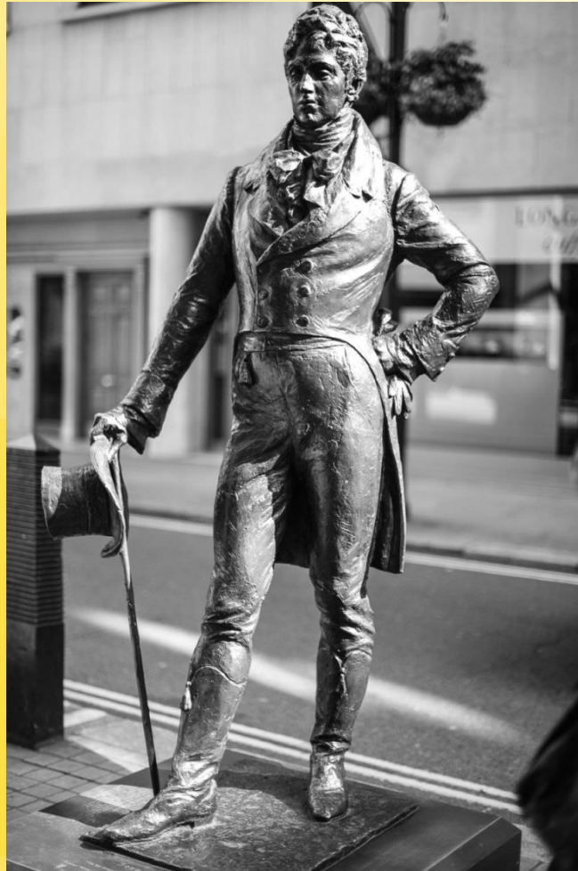
The statue of Beau Brummell